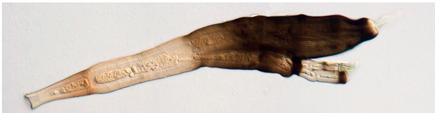
3. Laboulbenia eubradycelli (from Bradycellus harpalinus ); foot cell (left) and appendages (lower right) broken. Scale bar = 100 µm.