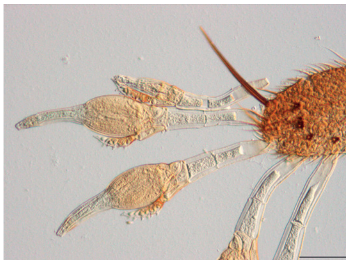
7. Stigmatomyces majewskii upon mouth part of Drosophila subobscura . Scale bar = 50 \mu m. 7. Stigmatomyces majewskii op monddeel van Drosophila subobscura . Maatstreef = 50 \mu m.

The hosts of R. lasiophorus are typical for banks of stagnant water, swamps and marshes (Desender et al. 1995, as Acupalpus consputus , Turin 2000), a common habitat in De Kaaistoep.