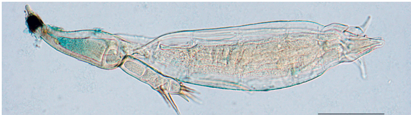
5. Hesperomyces virescens (from Harmonia axyridis ). Scale bar = 50 \mu m. 5. Hesperomyces virescens (op Harmonia axyridis ). Maatstreef = 50 \mu m.