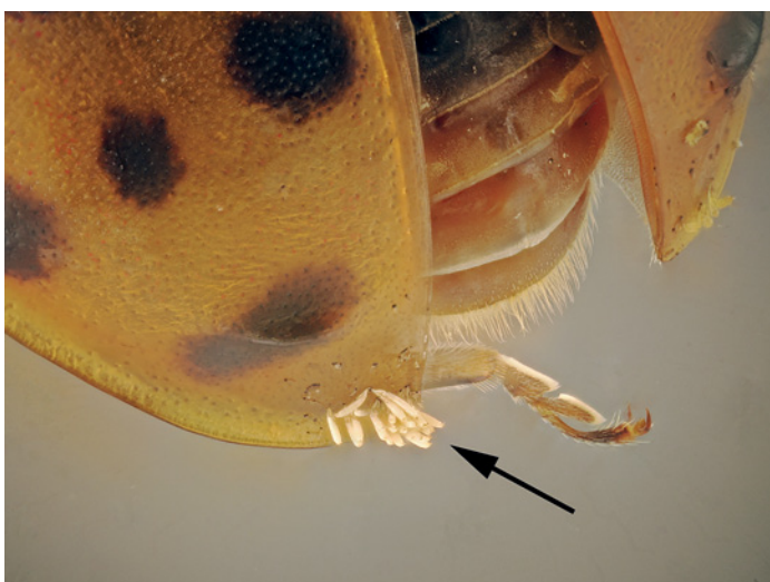
4. Hesperomyces virescens upon left elytron of Harmonia axyridis .