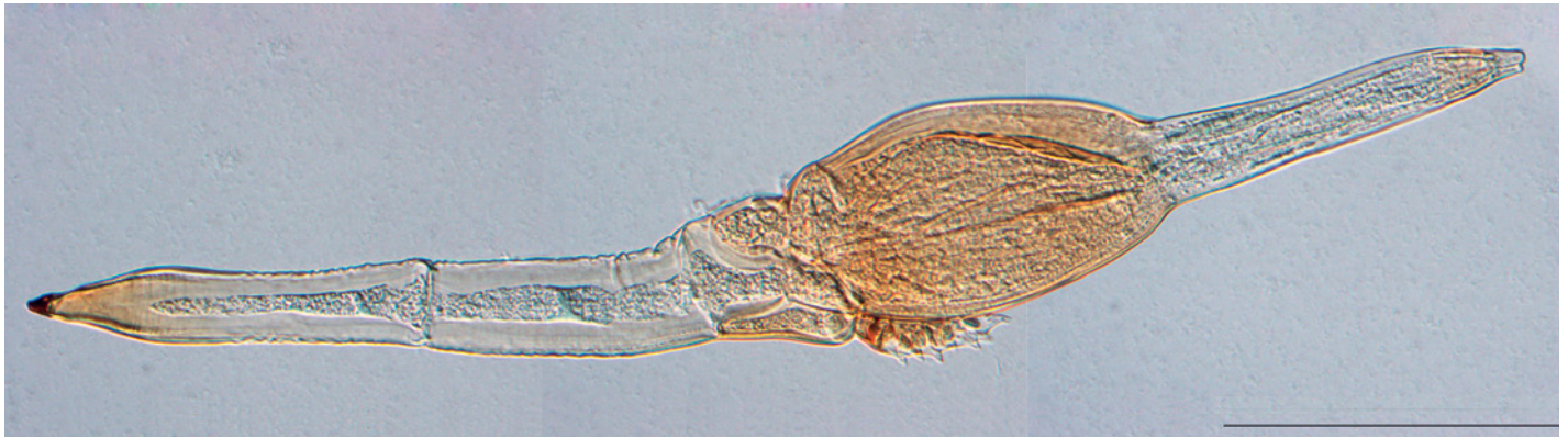
8. Stigmatomyces majewskii (from Drosophila subobscura ). Scale bar = 100 µm.