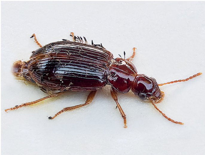
2. Bradycellus harpalinus (Carabidae) covered with Laboulbeniales ( Laboulbenia eubradycelli ). 2. Bradycellus harpalinus (Carabidae) geparasiteerd door Laboulbeniales ( Laboulbenia eubradycelli ).

than direct transmission. This is due to the nature and short life-span of the spore (De Kesel 1995b) and the fact that they cannot spread through air over long distances (Huldén 1983).