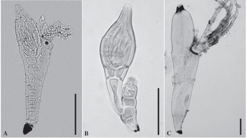
PLATE 1. A. Blasticomyces lispini (FH 00313486). B. Cantharomyces orientalis (FH 00313465). C. Laboulbenia anoplogenii (FH 00313461). Scale bars = 50 \mu m.

studied thallus differs from the original description of B. lispini in displaying shallow blackening of the outer margins of receptacle basal cells 2–4.