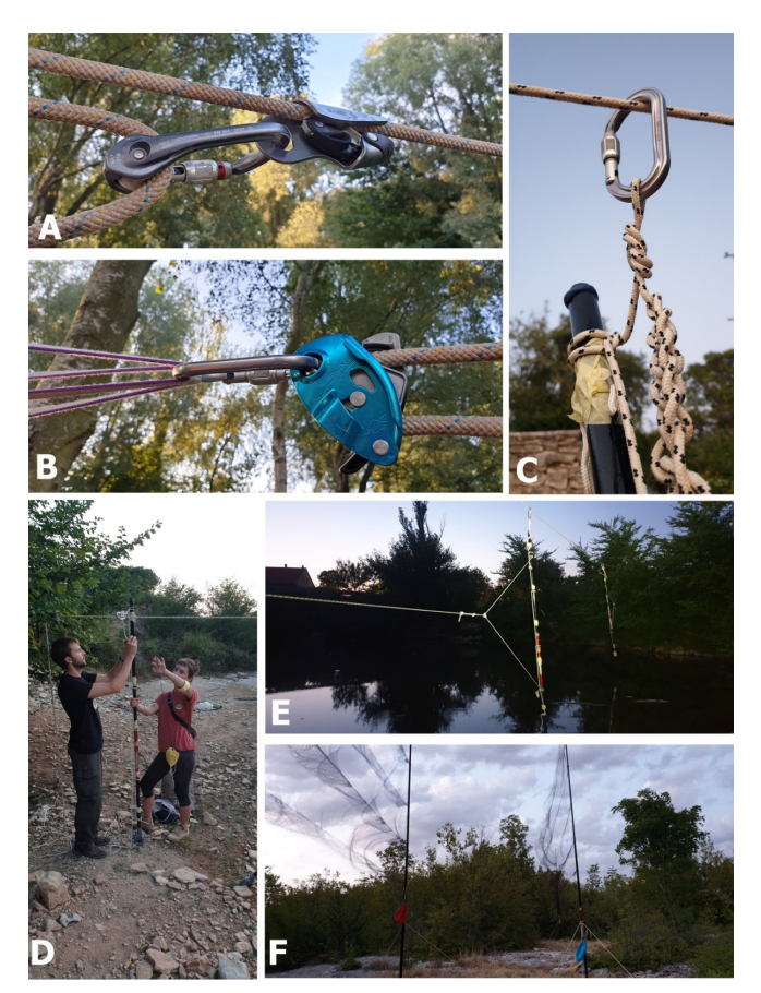
Fig. 2 - Photos of the skynet as trialled by the authors. A . Use of a Petzl basic as the rope grab in a 3:1 haul system to tension the TL. B . Petzl gri gri used to remove slack and maintain tension on one side of the TL, attached to the tree behind via a carabiner and nylon climbing sling. C . Knotwork attaching a pole to TL. Clove hitch secures guy rope to pole; carabiner is clipped to TL and through a figure-of-8 on the bight. D . Surveyors attaching a pole to tension line. E . Suspended net in position over the pond. F . Orientation of suspended and terrestrial nets.